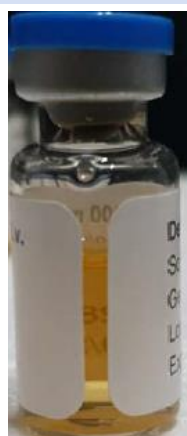
Sample from Latvia