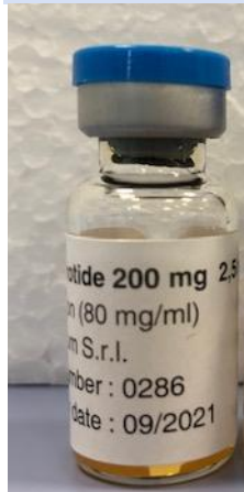
Sample from Latvia