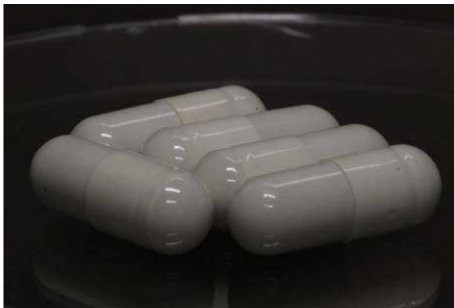
Capsules of Diet Slim – Batch 0103; Expiry date 01/2020