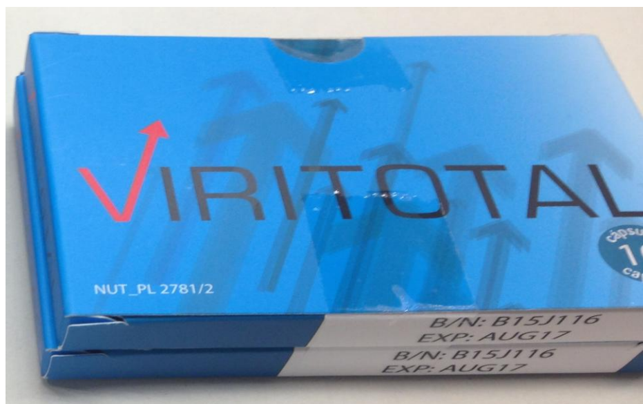
Viritotal capsules (1)