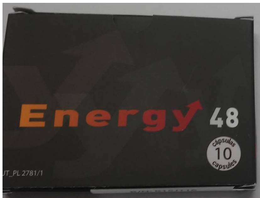
Energy 48 capsules (1)